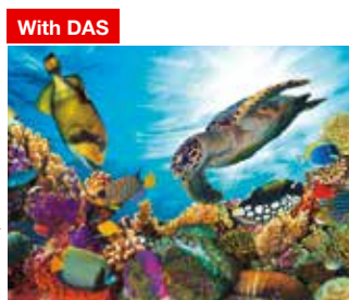
Correct drop landing position and paper feeding ensures the highest print quality